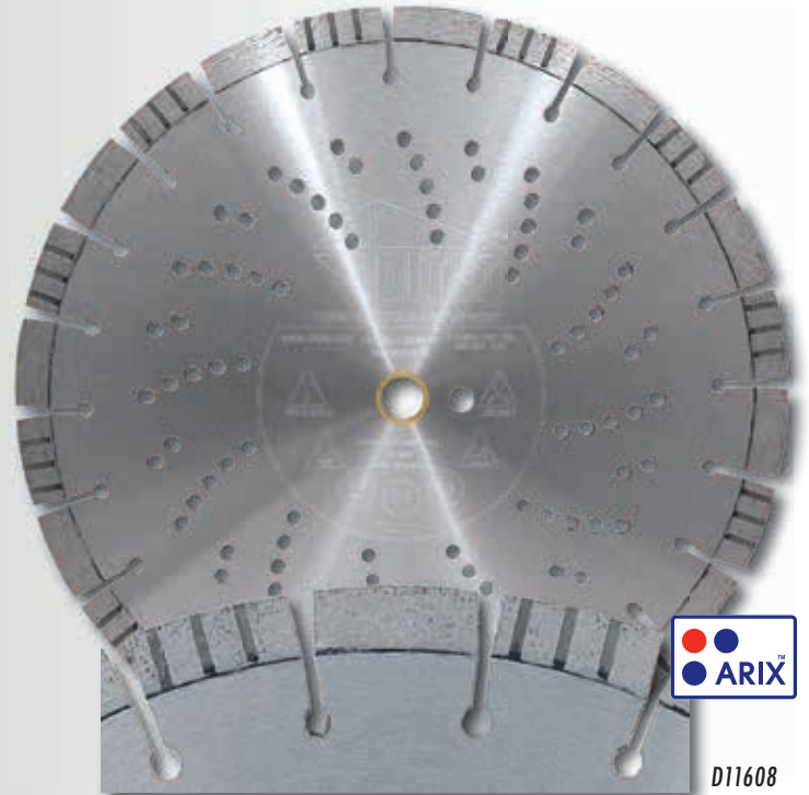
G3 ARIX™ Turbo Standard Segment